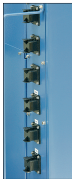
Six additional temperature channels for control of spray guns, heaters, etc.